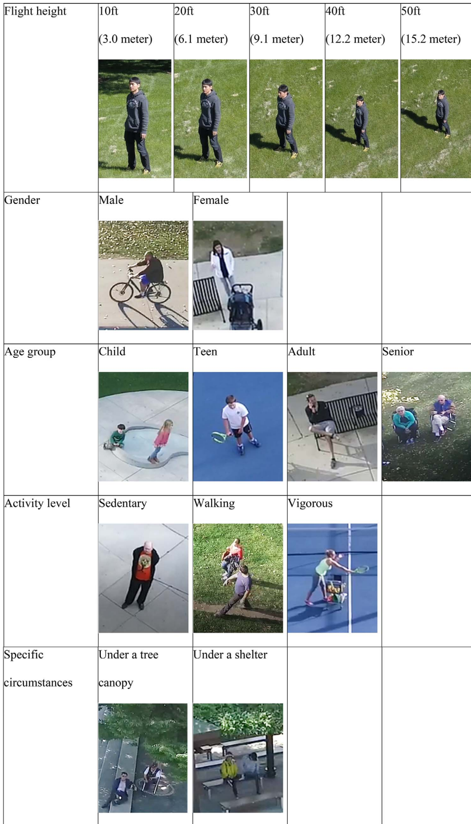
Fig. 2. UAV-recorded image examples by flight height, gender, age group, activity level, and circumstance.

Federal Aviation Administration, and the researcher obtained approval from both IRB (approved July 29, 2016) and the municipal park department.